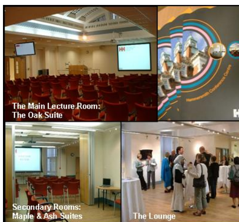
The Main Lecture Room: The Oak Suite